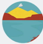
GOMA Democratic Republic of Congo