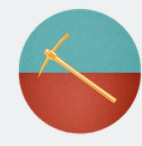
LUBUMBASHI Democratic Republic of Congo